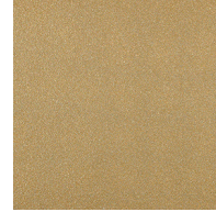
Jazz Gold - 29