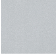
Sparkling Silver - 01