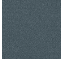
Twilight - 14